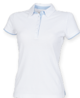
WHITE / SKY BLUE